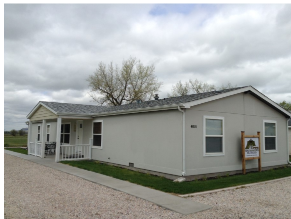
Current Home Office in LaGrange, Wyoming

The Home Office of TBM has had a few locations since it was founded in 1985. The first was in Grand Rapids, Michigan in the small personal office of the Mission's secretary. Years later, Rocky Mountain Bible Church in Frisco, Colorado provided the second location by allowing TBM to use office space in their building. Then, in 2009, through God's provision TBM was able to purchase the current Home Office facility and place it in LaGrange. This meant big changes for the operational side of TBM. Among other changes was that of owning a facility rather than using borrowed office space. Board and staff meetings, TBM's daily operations, and TBM Candidate School could now take place in a centralized location. The new space allows for maintaining guest rooms for visitors including missionaries home on furlough. These are all benefits of the new location, but the question remains, "Why LaGrange?". TBM could have chosen a more populated area, right?